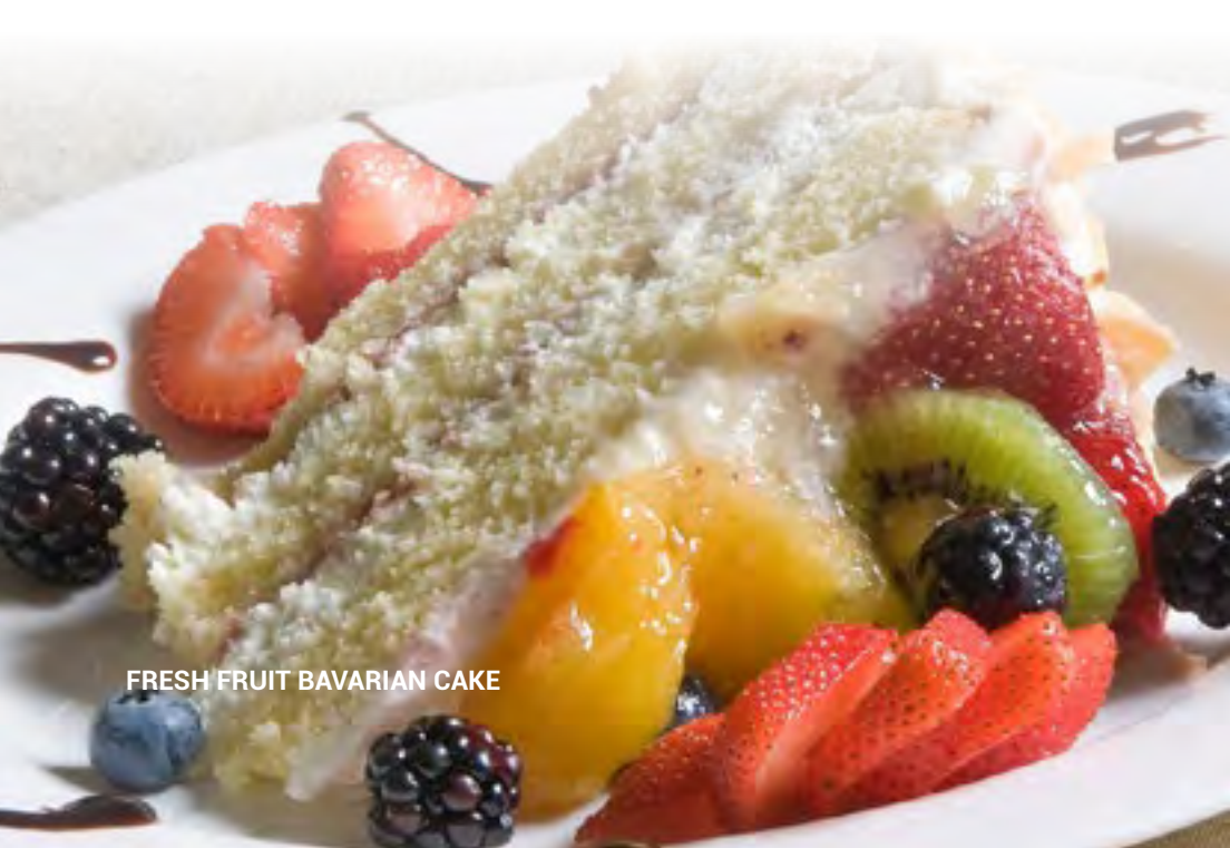
FRESH FRUIT BAVARIAN CAKE

Layers of Vanilla and Chocolate Cake, Filled and Iced Iced with Crush Oreo Buttercream.