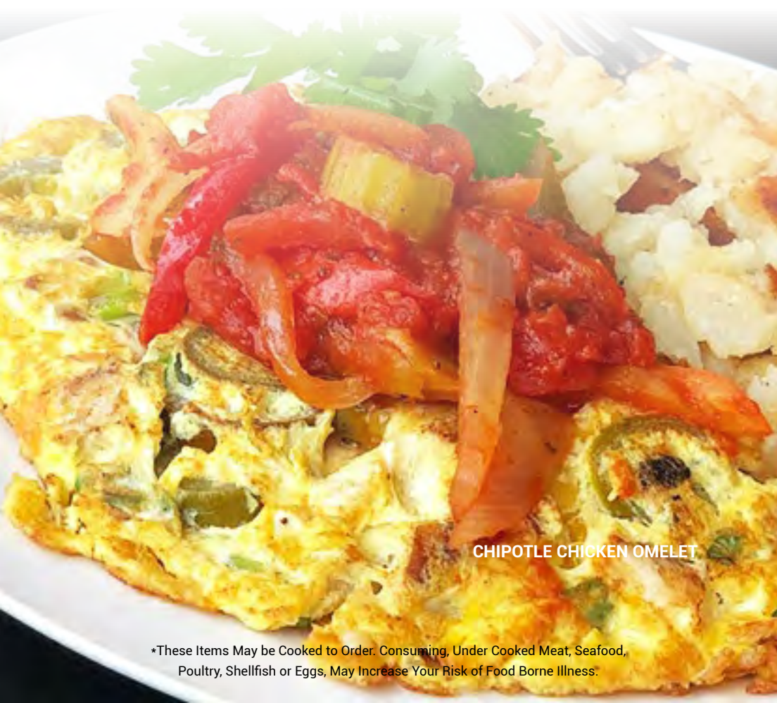
CHIPOTLE CHICKEN OMELET

With Rotisserie Chicken, Jack Cheese, Jalapeños and Cheddar Cheese with a Salsa Sauce