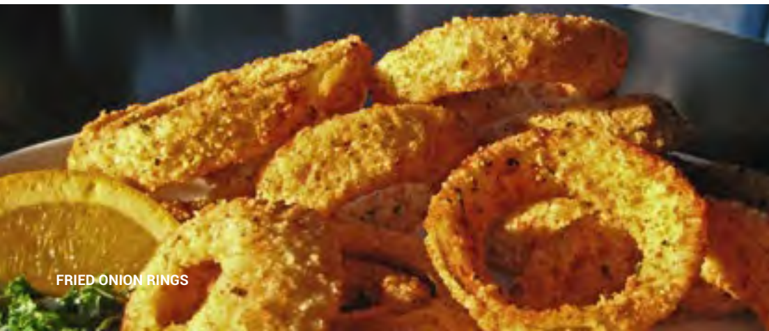
FRIED ONION RINGS

Steak, Cheese, Mushrooms, Green Peppers and Onions in a Crispy Spring Roll.