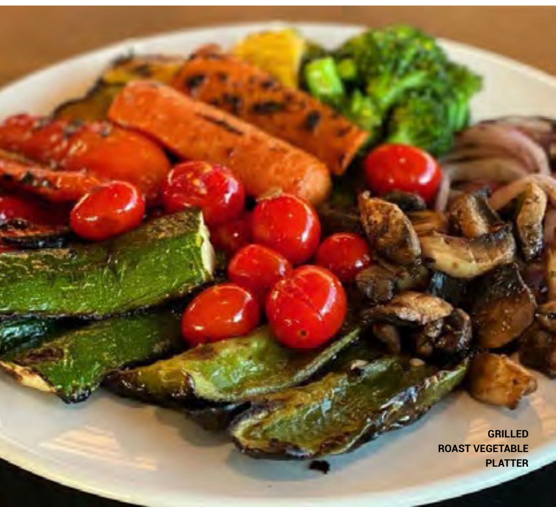
GRILLED ROAST VEGETABLE PLATTER