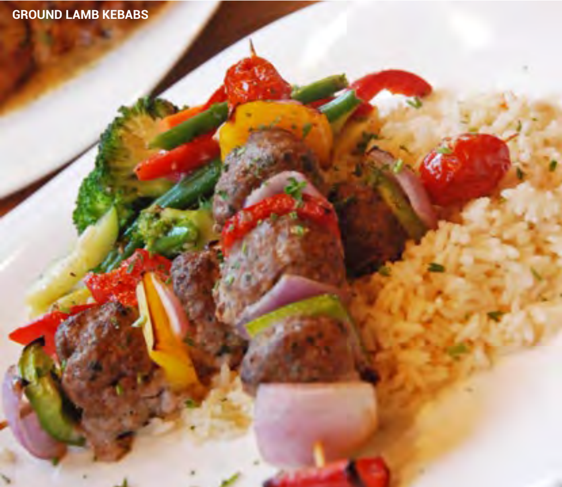
GROUND LAMB KEBABS

Amphora Mixed Grill* ..... 19.95 Marinated Grilled Beef Tenderloin Medallion, Lamb Kebab, Grilled Chicken Medallions and Sweet Italian Sausage