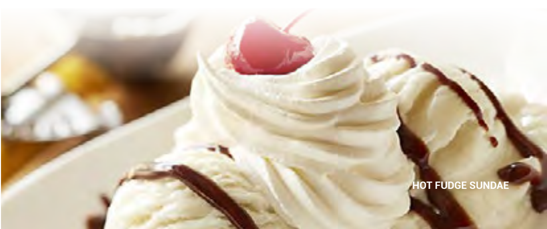
HOT FUDGE SUNDAE

Three Scoops of Vanilla Ice Cream, Marshmallow Topping and Rich Hot Fudge, Snuggled Between Graham Crackers and Topped with Whipped Cream and Chocolate Chips